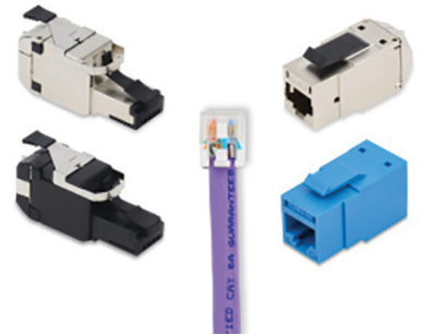
Universal REVConnect Core accepts both jack and plug housings.

Belden’s REVConnect Connectivity System is a new RJ45 connectivity system that offers versatility by using universal termination core cable and a single reliable and easy termination method for all RJ45 connections. Its unique universal termination process can be used with both shielded and unshielded cables, Category 5e through Category 6A and can accept both jack and plug housings.