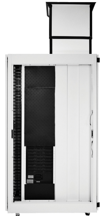
Vertical exhaust duct option to maintain airflow segregation

> FOR MORE DETAILS VISIT ANIXTER.COM/SHOPCPI