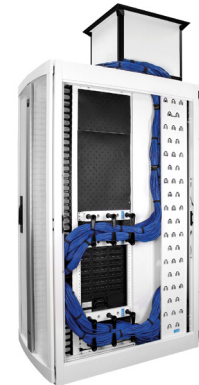
Complete airflow isolation for high-density network and storage switches