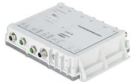
BAT450-F Industrial Wireless LAN Access Point