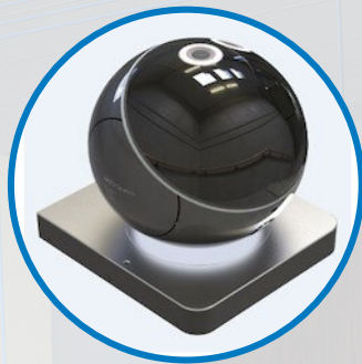
TOUCHLESS FACE/IRIS/ PALM VEIN/FINGERPRINT READER