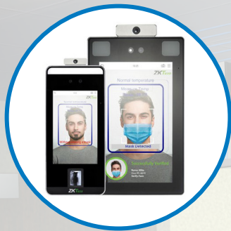
FACE/MASK/ TEMP READER