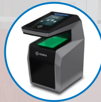
TOUCHLESS MULTI-FINGER READER