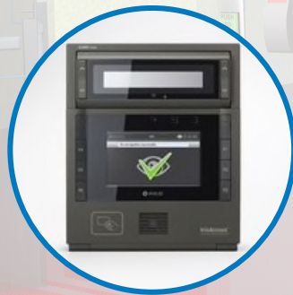
DUAL IRIS RECOGNITION